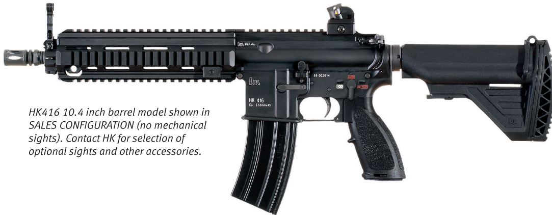
HK416 10.4 inch barrel model shown in SALES CONFIGURATION (no mechanical sights). Contact HK for selection of optional sights and other accessories.

The HK416 is a 5.56x45mm magazine fed lightweight auto rifle available in multiple barrel lengths that is gas operated via short stroke gas piston system for enhanced reliability built on the common M4/M16/AR15 style platform. Often discussed as the multi-role weapon.